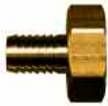
SWIVEL CONNECTOR Hose Barb To Female Hose

FAIRVIEW BRASS WATER FITTINGS ARE MACHINED FROM SOLID BAR STOCK FOR STRENGTH AND DURABILITY. THEY ARE IDEALLY SUITED FOR INDUSTRIAL APPLICATIONS, PLUMBING INDUSTRY, MOBILE HOME AND TRAILER WATER HOOK-UPS.