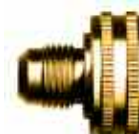
SWIVEL CONNECTOR S.A.E. Flare To Female Hose