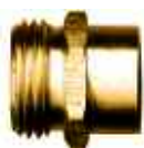
COUPLING Male Hose To Female Pipe