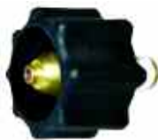
1-5/16" Female ACME TAILPIECE ASSEMBLY