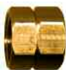
SWIVEL COUPLING Female Hose To Female Pipe