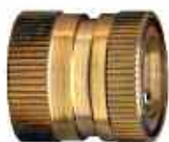
PART No. QD-WHCF

DESCRIPTION Quick Disconnect Coupler X Water Hose Thread