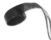
PLASTIC ACME CAP