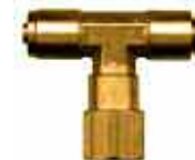
TEE Ends Tube Centre Female Pipe Swivel

Low Temperature (-60°F, -51°C) D.O.T. Push-To-Connect Fittings Available On Request.