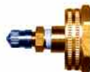
WATER LINE AIR DRAIN VALVE