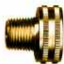
SWIVEL CONNECTOR Male Pipe To Female Hose