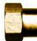
COUPLING Female Hose To Female Pipe