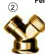
Y COUPLINGS Male Hose To Female Hose

Valved couplings give you easy access for opening and closing your watering system.