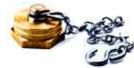
HEX-KNURL CAP NUT