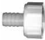
NYLON SWIVEL CONNECTOR Hose Barb To Female Hose