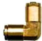
90° ELBOW Tube To Tube