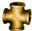
CROSS (Cast Bronze)