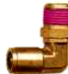
90° ELBOW Tube To Male Pipe Swivel