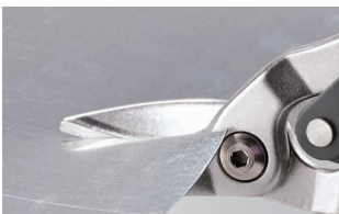
Flush Bolt Design Won't hang up on material