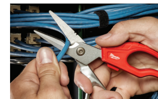
Wire Gullet Prevents Walking