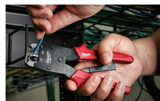
Parallel Crimping Design