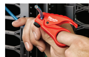
Optimized Finger Loop