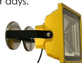
LE970LED-MAG Magnet mount model