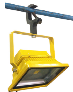
LE970LED-CLAMP Clamp mount model