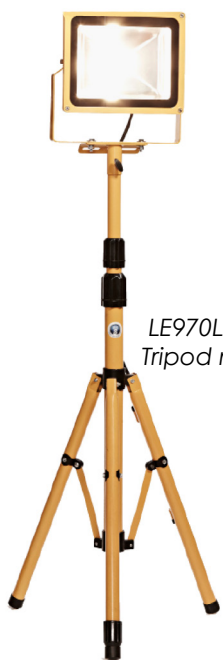
LE970LED-TR Tripod model

The Beacon Light is the only portable LED floodlight on the market that is built strong enough to withstand the toughest environments without compromising on high-quality light output. The Beacon Light projects a wide, shadow-free flood of crisp bright white light generated via a 30W or 50W LED integrated chip, which is solid-state and can therefore endure shocks, vibrations and rough handling without breaking the LEDs. The Beacon will provide an instant start in even the coldest locations, and the unit remains cool-to-the-touch even if left running for days.