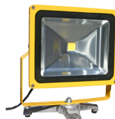
LE970LED-FS Floor stand model