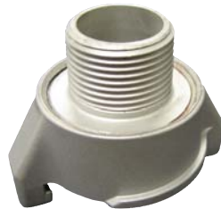
SF-5 1" Male Adapter