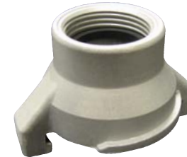
SF-6 1" Female Adapter