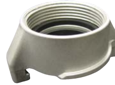
SF-4 1 1/2" Female Adapter