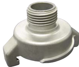
SF-33 3/4" Male Adapter