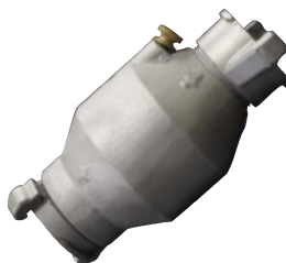
SF-14 Ball Check Valve