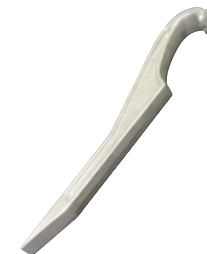
SF-16 Standard Coupling Wrench