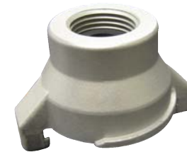
SF-34 3/4" Female Adapter