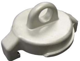
SF-13 Coupling Plug/Cap