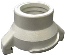
SF-2 1" Instantaneous Hose Coupling