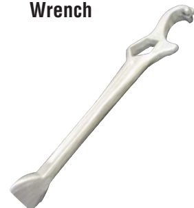
SF-15 Combination Hose Coupling/Hydrant Wrench