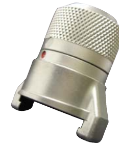
SF-FBN Adjustable Spray Nozzle