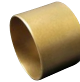
SF-8 1 1/2" Brass Expansion Ring