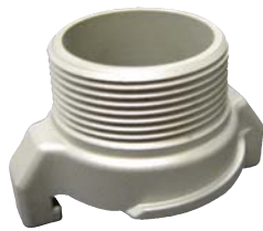
SF-3 1 1/2" Male Adapter