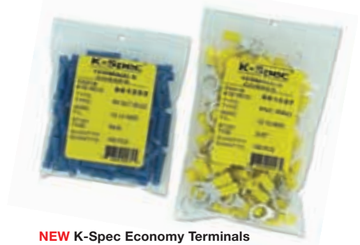
NEW K-Spec Economy Terminals are packaged in re-sealable bags