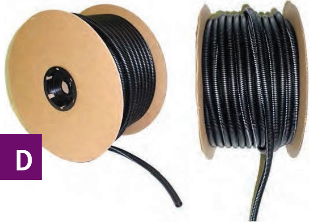
Convoluted Tubing/Split Loom (Polyethylene) on Spools