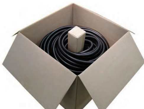
Convoluted Tubing/Split Loom (Polyethylene) in a Bulk Box

Split Loom Installation Tools can be found on pages 103 & 106. Loom/Tubing Cutting Tools can be found on page 106