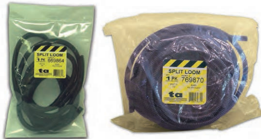
Convoluted Tubing/Split Loom (Polyethylene) in Small Packaging

Split Loom Installation Tools can be found on pages 103 & 106. Loom/Tubing Cutting Tools can be found on page 106