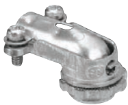
Zinc Die Cast Locknut