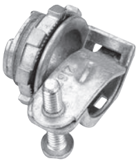
Zinc Die Cast Locknut