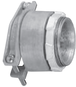
Zinc Die Cast Locknut