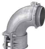
Zinc Die Cast Locknut