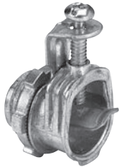
Zinc Die Cast Locknut