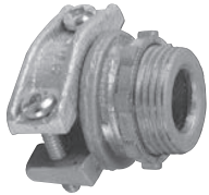
Zinc Die Cast Locknut