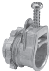
Zinc Die Cast Locknut