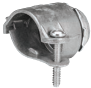
Zinc Die Cast Locknut