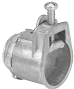
Zinc Die Cast Locknut