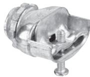
Zinc Die Cast Locknut