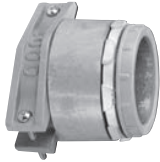
Aluminum Locknut and Plastic Bushing