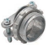
650-DC2 thru 676-DC2