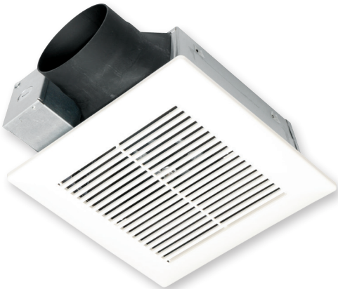
FV-07VBA1 + FV-07VBB1

FV-07VBA1 – Fan Housing FV-07VBB1 – Motor/Grille Assembly