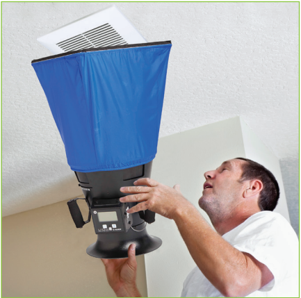
Balometer used to verify installed performance

Compliance with ASHRAE 62.2, the national ventilation standard, is now required for ENERGY STAR® for Homes 3.0