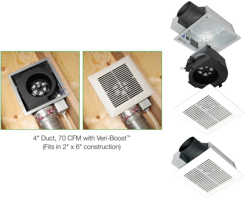
4" Duct, 70 CFM with Veri-Boost™ (Fits in 2" x 6" construction)

EcoVent™ is offered in contractor packs, whereby the housing and motor/grille assembly are packaged separately. This easy to manage package design allows contractors to store the components separately without the fear of parts getting lost or damaged on site.