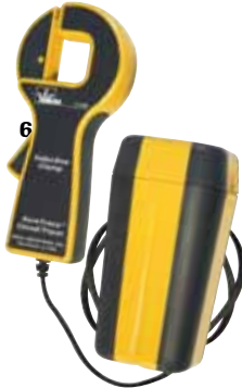
Inductive Clamp & Battery Pack