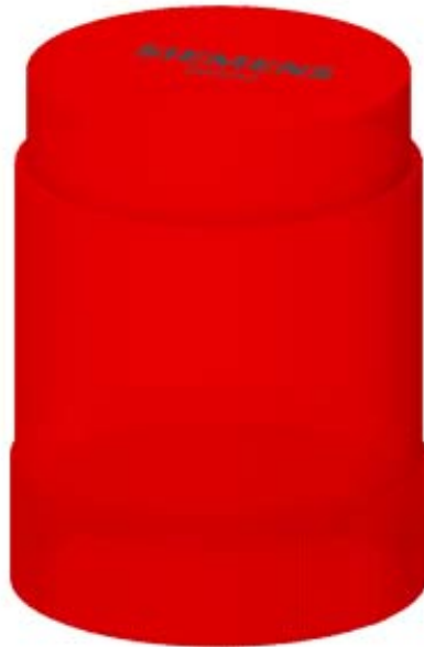
STEADY-LIGHT ELEMENTS, RED AC/DC 24V...230V