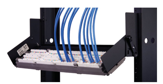
Front Hinged Bracket in the 120° position