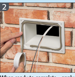
When ready to complete... apply supplied caulk as shown and press around edges of adapter sleeve.