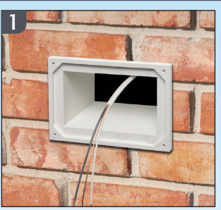
Mortar in adapter sleeve. Pull wire and tie off to loop in adapter sleeve.