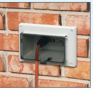
Accepts most single gang wiring devices, and uses a standard indoor wall plate. DHB1C shown.