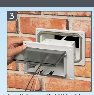
Install the supplied NM cable connector and wire. Insert the clean IN BOX into the sleeve.