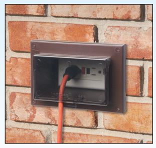
Weatherproof-in-use. DHB1BRC shown. IN BOX Saves Time.