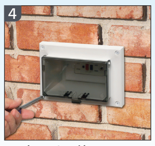
Attach IN BOX with screws provided. Install wiring device per manufacturer's instructions, Local and National Electrical Codes.