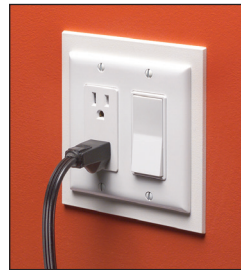
FD2RP install complete!