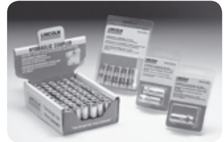
Hydraulic coupler displays