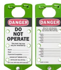
Legend Option 2