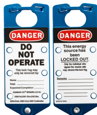
Legend Option 1