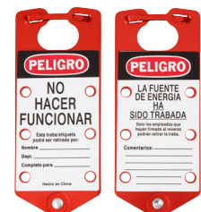
Legend Option 3