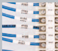
PermaSleeve® Wire Marking Sleeves