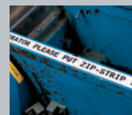
Safety Labels ...and many more!