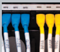
Voice & Data Communications