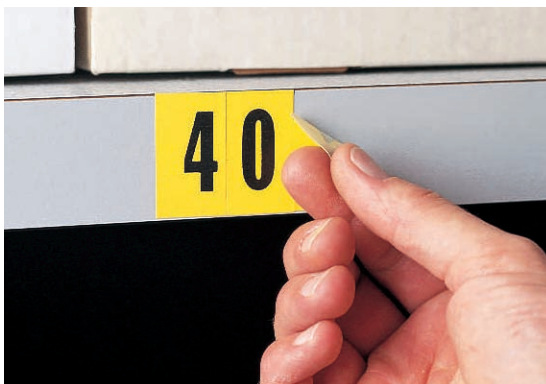
34 Series Numbers and Letters can be removed - great for frequent stock changes!