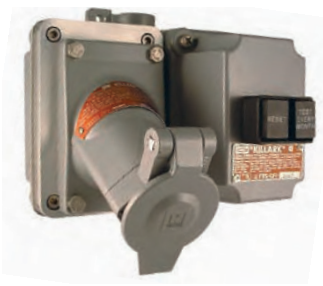
For GFI Protection with receptacle, See page PR26

Class I, Div. I & 2, Groups C,D Class I, Zones 1 & 2, Groups IIB, IIA Class II, Div. 1 & 2, Groups E,F,G Class III NEMA 3, 7(C,D) 9(E,F,G)