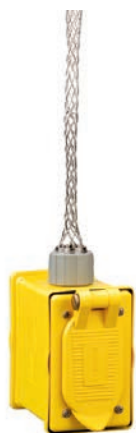
Deluxe Cord Grips (purchased separately)