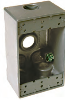
5321-0 TO 5321-6, 5330-0