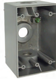
5385-0 TO 5387-0