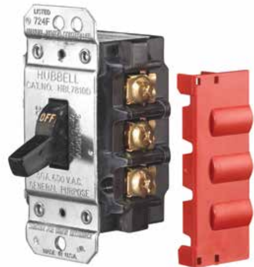
30A, 40A and 50A