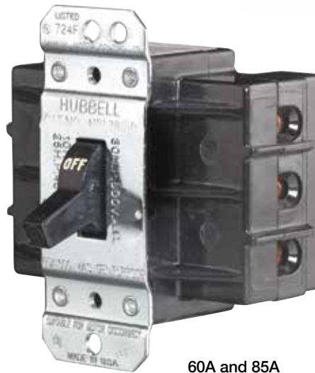
60A and 85A