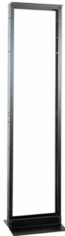
3" Deep Rack Recommended for Cat 5e/6 cables