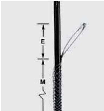
Offset Eye, Split Mesh, Lace Closing