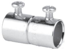
CI5120 / CI5132