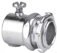
CI5410 (-IT) / CI5432 (-IT)