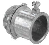
CI5010 (-IT) / CI5016 (-IT)