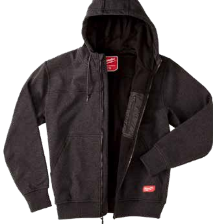
NO DAYS OFF™ Hooded Sweatshirt 311