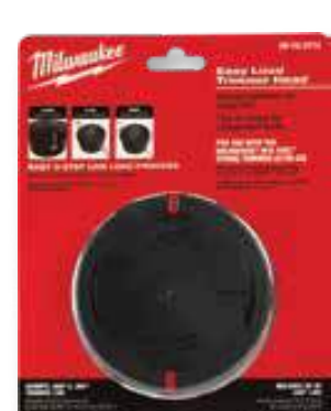
Easy Load Trimmer Head 49-16-2714