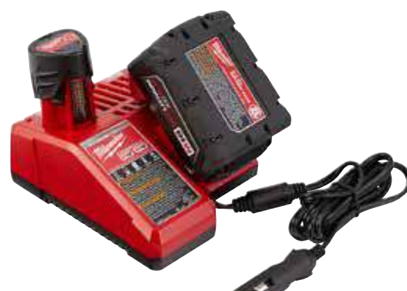
M18™ / M12™ Vehicle Charger 48-59-1810