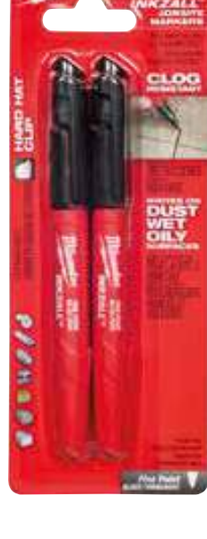
2PK INKZALL™ Black Fine Point Marker 48-22-3105