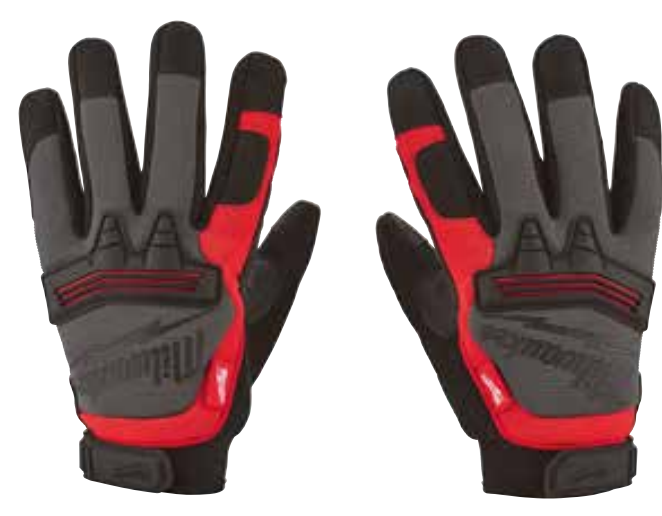
Demolition Gloves 48-22-8732