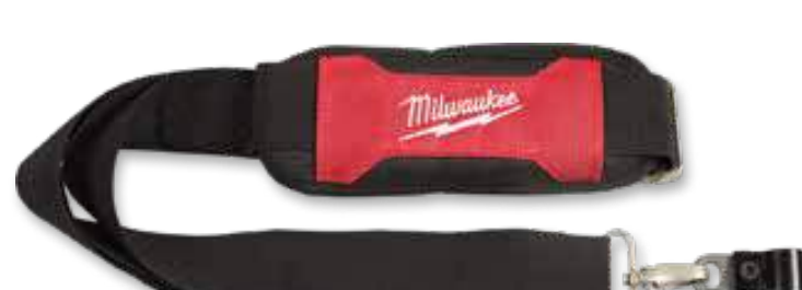
Shoulder Strap 49-16-2722