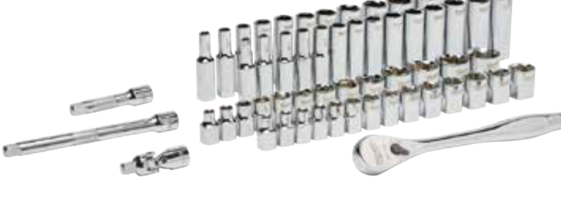
3/8" Drive 56pc Ratchet & Socket Set - SAE & Metric 48-22-9008