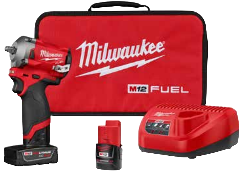
M12 FUEL™ 3/8" Stubby Impact Wrench Kit 2554-22