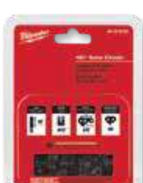
10" Saw Chain 49-16-2723