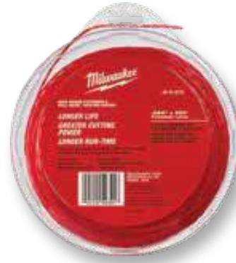
.095" x 250' Trimmer Line 49-16-2713