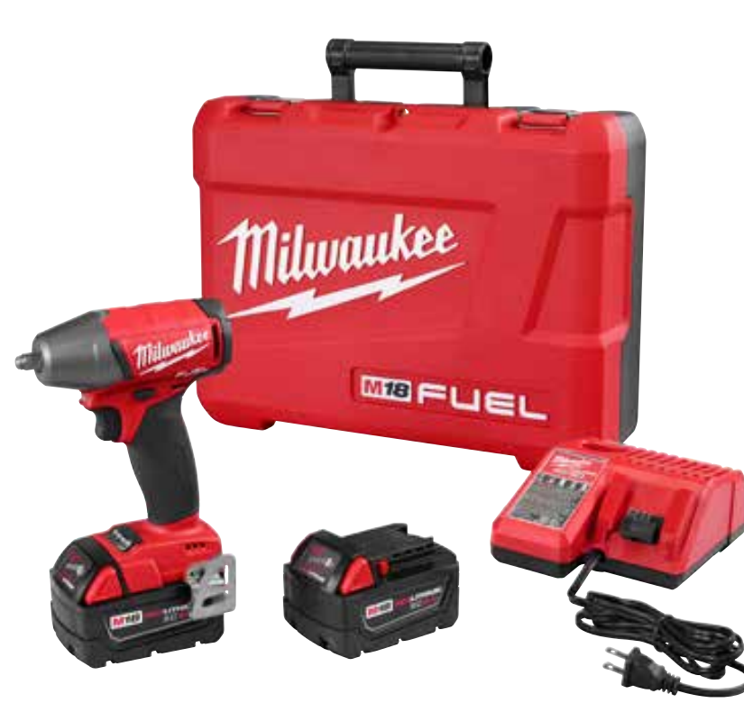
M18 FUEL™ 3/8" Compact Impact Wrench w/ Friction Ring Kit 2754-22