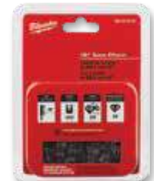
16" Saw Chain 49-16-2715