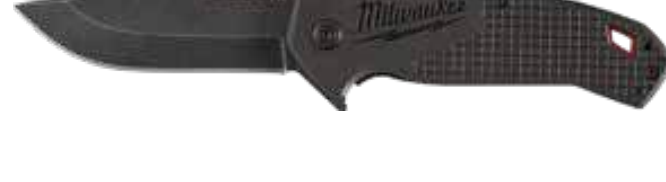
3" HARDLINE™ Smooth Blade Pocket Knife 48-22-1994