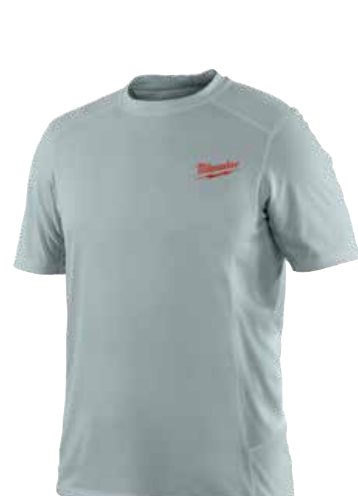
WORKSKIN™ Light Weight Performance Shirt 410