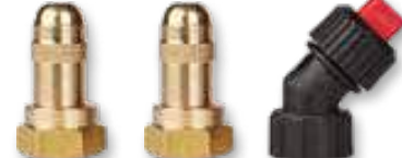
Replacement Sprayer Nozzles 49-16-2728