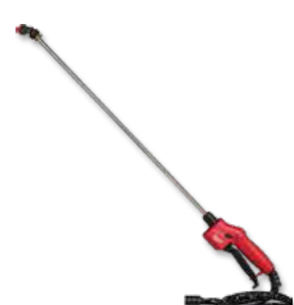
Replacement Sprayer Hose, Handle & Wand Assembly 49-16-2727