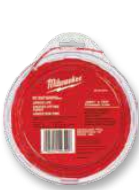
.080" x 150' Trimmer Line 49-16-2712