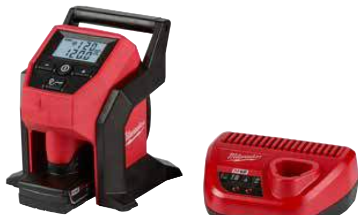
M12™ Compact Inflator kit 2475-21XC