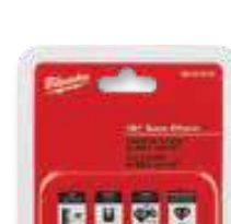
16" Saw Chain 49-16-2715