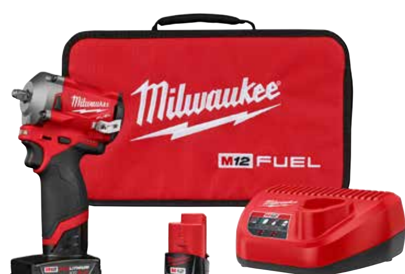
M12 FUEL™ 3/8" Stubby Impact Wrench Kit 2554-22