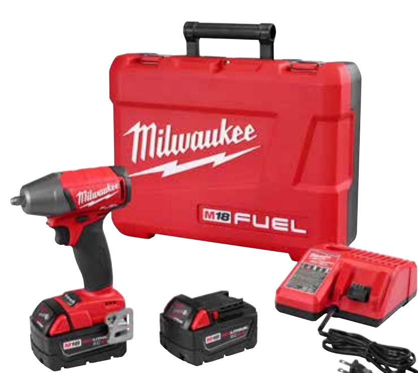
M18 FUEL™ 3/8" Compact Impact Wrench w/ Friction Ring Kit 2754-22