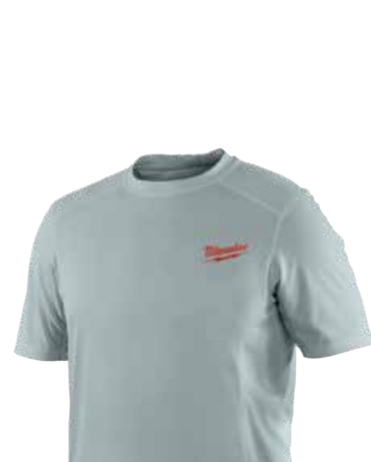
WORKSKIN™ Light Weight Performance Shirt 410