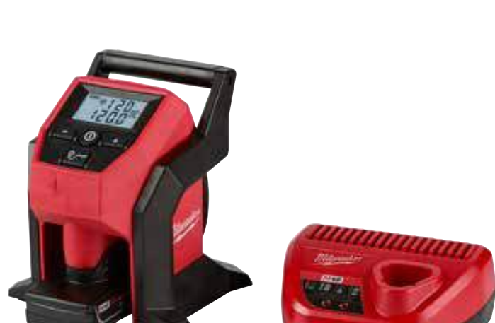
M12™ Compact Inflator kit 2475-21XC