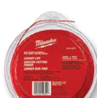
.095" x 250' Trimmer Line 49-16-2713