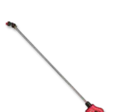
Replacement Sprayer Hose, Handle & Wand Assembly 49-16-2727