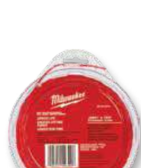
.080" x 150' Trimmer Line 49-16-2712