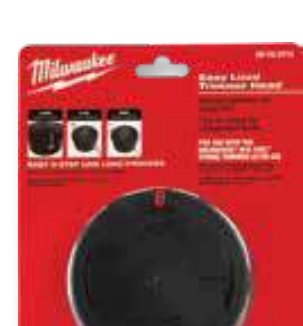
Easy Load Trimmer Head 49-16-2714