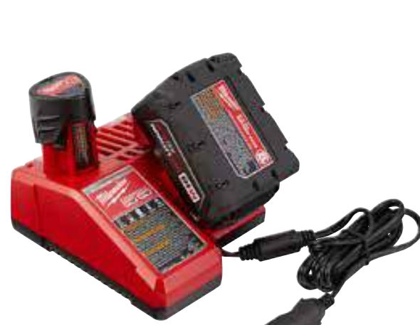
M18™ / M12™ Vehicle Charger 48-59-1810