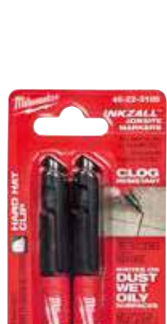
2PK INKZALL™ Black Fine Point Marker 48-22-3105