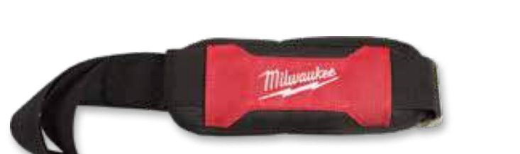
Shoulder Strap 49-16-2722