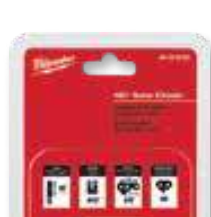
10" Saw Chain 49-16-2723