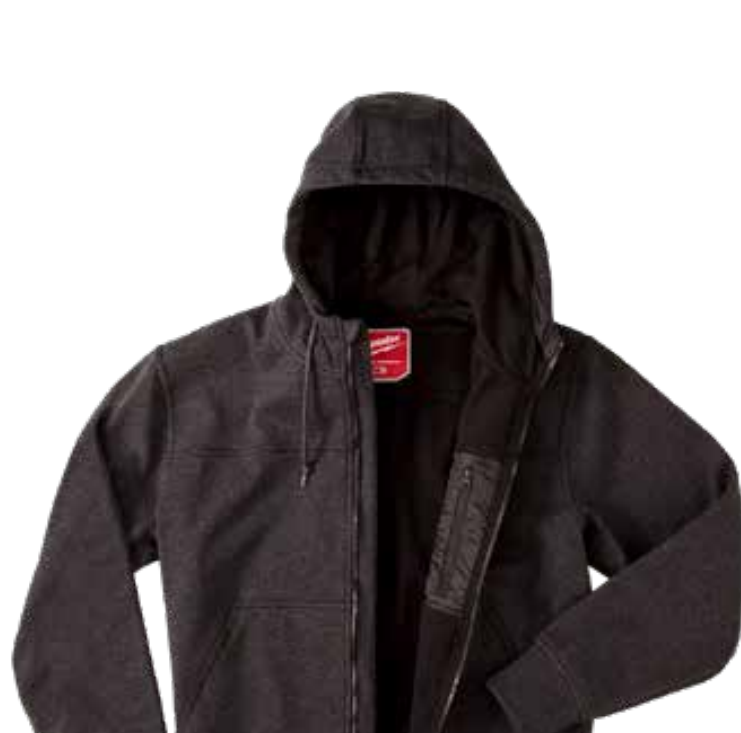
NO DAYS OFF™ Hooded Sweatshirt 311