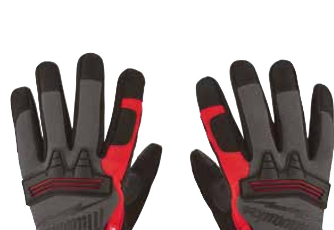
Demolition Gloves 48-22-8732