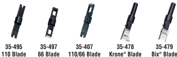
35-495 110 Blade 35-497 66 Blade 35-407 110/66 Blade 35-478 Krone® Blade 35-479 Bix® Blade

Bix® is a registered trademark of Nortel. Krone® is a registered trademark of Krone, Inc.