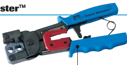
New cushion-grip handles