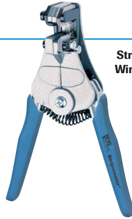
Stripmaster® Wire Stripper