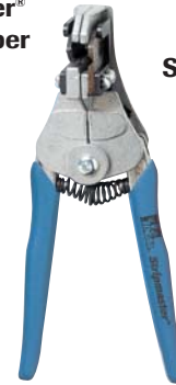
Stripmaster® Lite Wire Stripper